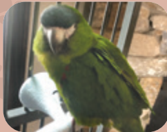
Echo, Nolan Hill