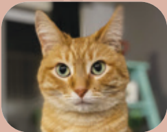
Crouton, Signal Hill